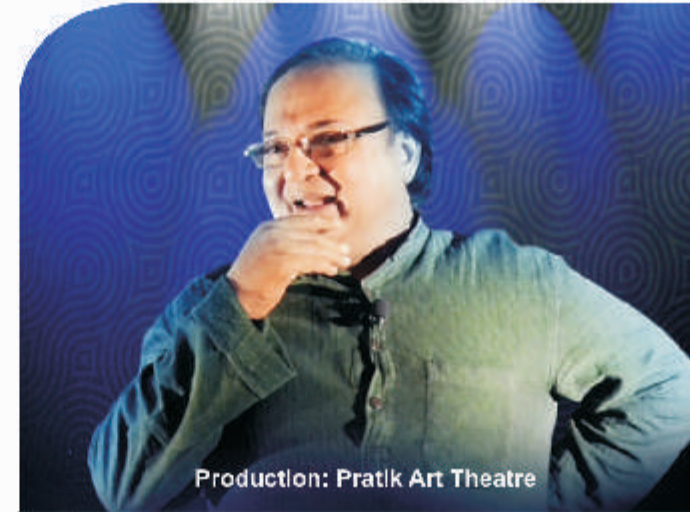
Production: Pratik Art Theatre

A two hour hilarious monologue performed by RAKESH BEDI